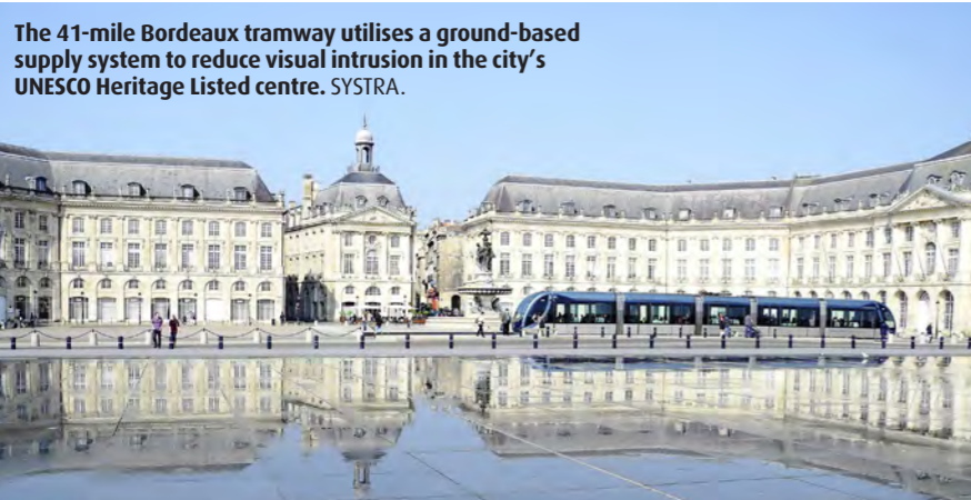
The 41-mile Bordeaux tramway utilises a ground-based supply system to reduce visual intrusion in the city's UNESCO Heritage Listed centre. SYSTRA.

A SYSTRA-led consortium project managed the Bordeaux tramway (Communauté Urbaine de Bordeaux) which opened in 2003, and which will carry more than 430,000 passenger per day on completion of Phase 3. System Engineering Manager at SYSTRA Mathieu Melenchon explains: