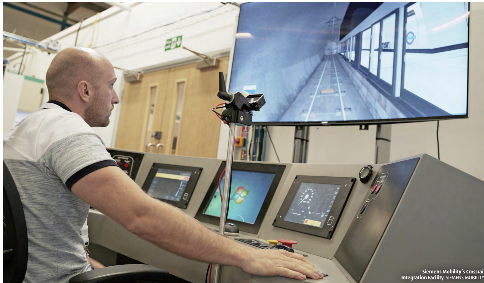
Siemens Mobility's Crossrail Integration Facility.

Stubbs says: "There is now a focus on system integration and recognition of both the technical and organisational complexities of this programme. As an example, Crossrail has established a Plateau team comprising technical leads from Crossrail, Siemens Mobility, Bombardier and the operator, to support system integration and promote