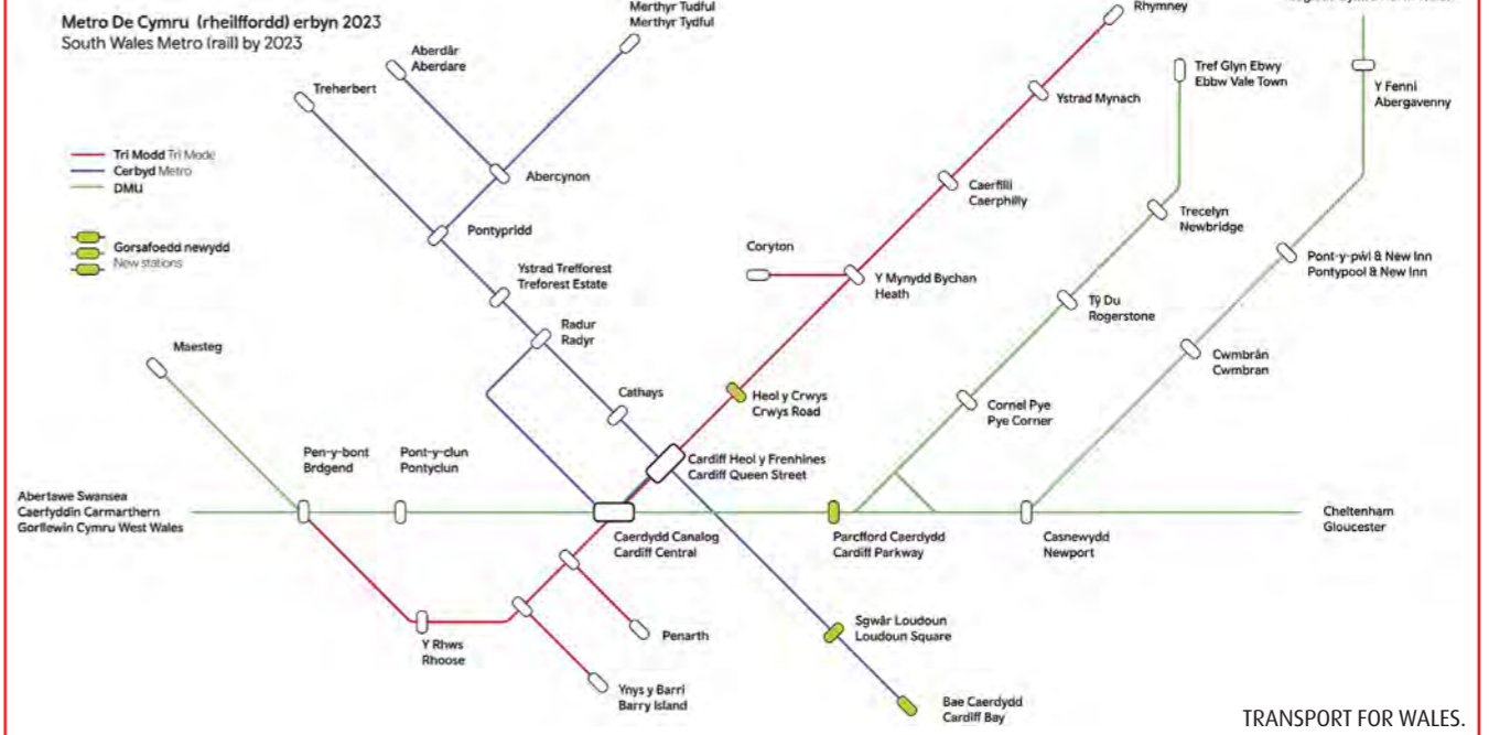
TRANSPORT FOR WALES.

“ We believe there is a risk in over-specifying projects on an input basis, so our approach was to leave it to the provider and leave the industry to innovate. ”