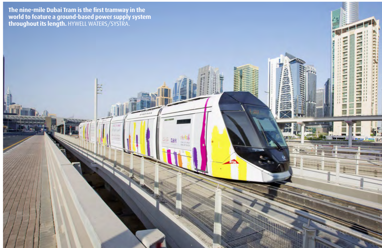
The nine-mile Dubai Tram is the first tramway in the world to feature a ground-based power supply system throughout its length.

"The same goes for hydrogen, which is emerging in heavy rail and looks set to make its debut in light rail in China. The more you produce, the more the costs come down, so while there are obvious cost implications for whichever system you go for, these promising technologies will help to solve many of the environmental and planning problems we face." ■