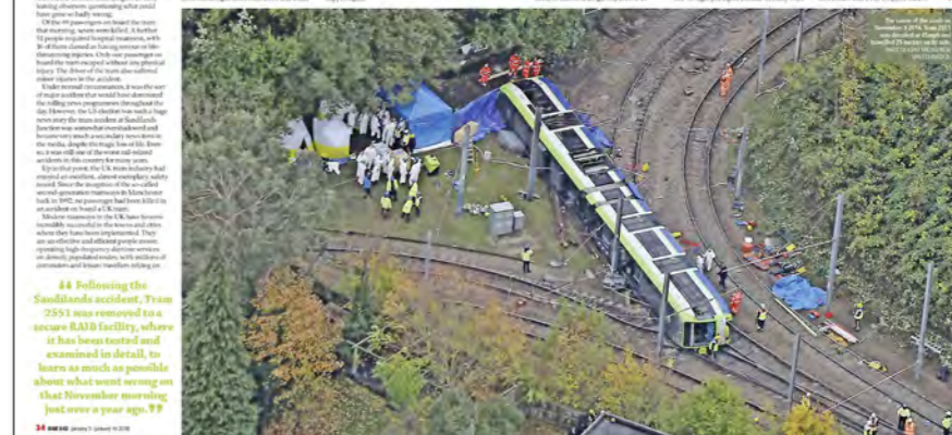
14 Following the Sandilands accident, Tram 2851 was removed to a secure RAIL facility, where it has been tested and examined in detail, to learn as much as possible about what went wrong on that November morning just over a year ago. 77

Fourteen months after the tram crash that killed seven passengers, ANDY COWARD looks back at the accident and analyses the safety recommendations made by the Rail Accident Investigation Branch