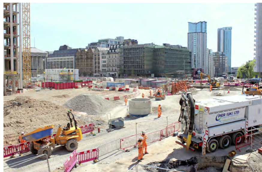
Construction continues apace for West Midlands Metro on a large site occupying Paradise Circus in Birmingham City Centre. The tram route will snake its way from outside Birmingham Town Hall in the background and into Centenary Square, to the right of the white lorry, and will include the UK's first stretch of catenary-free running. MIKE HADDON.